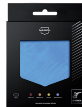
Super Fine Cut

Nasiol CleaRub 705 is a high-tech finishing compound that designed and improved to remove polishing marks, micro-scratches, and holograms. CleaRub 705 can be used on both brand new and old paints to get deep shine effect.