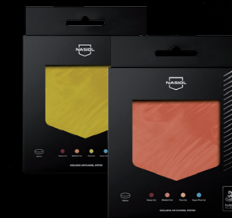
Nasiol Backing Plate

Innovative air channel system, facilitate the evacuation of the heat generated during the polishing process and prevent overheating. It protects pads from getting deformed or torn after washing. It is easy-to-applied even in the most curved areas and suitable for both rotary and orbital polishing machines.